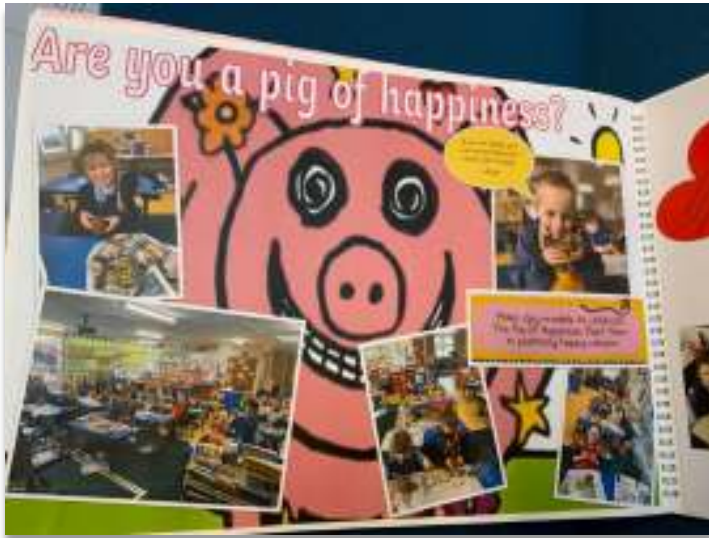
Welcoming. (Whoever you are).