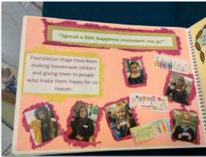
Brilliant. (The Gold Standard).